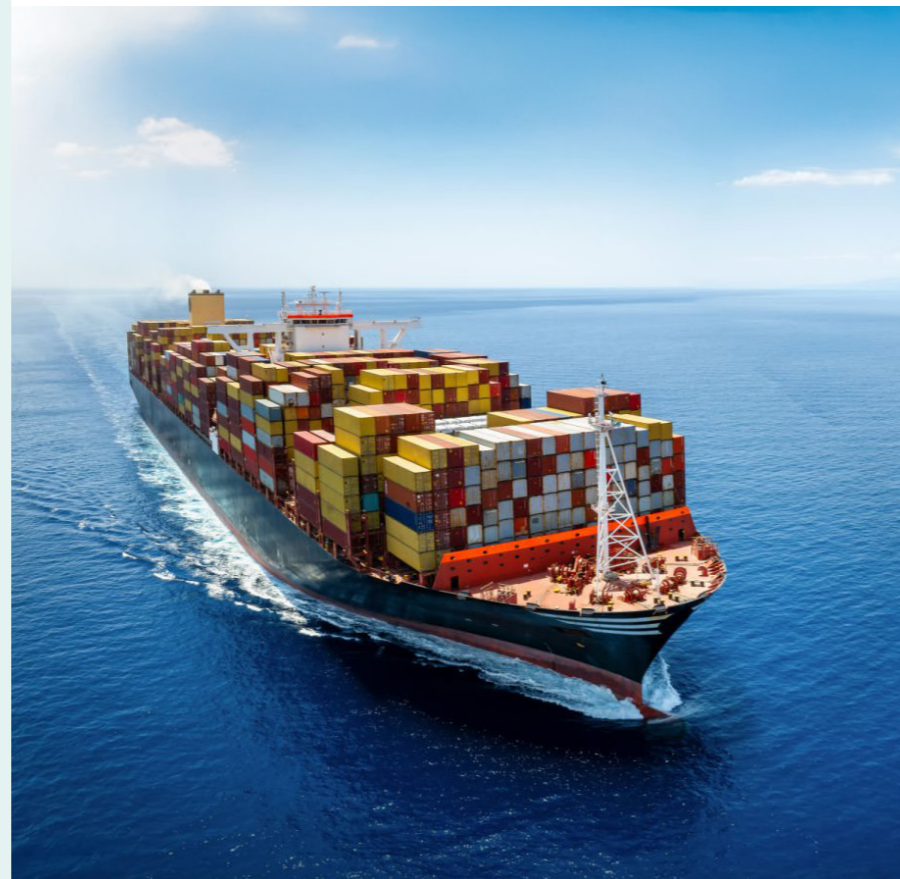
16 Maersk (2025) Vessel Particulars. ShipmentLink.

High efficiency ICE using low carbon drop-in fuels such as biofuel or renewable fuels such as ammonia or methanol. Large bulk carriers and tankers have similar use cases and decarbonisation pathways.